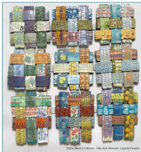
2024 Best in Show - We Are Woven, Laurie Frazer